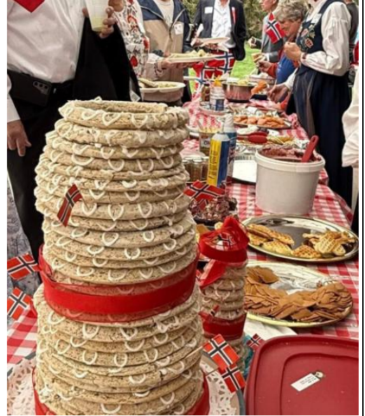
Food for all