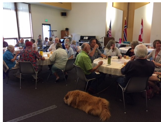
Everyone enjoys our Potluck Lunch