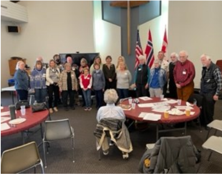
Officers are sworn in at the January Meeting