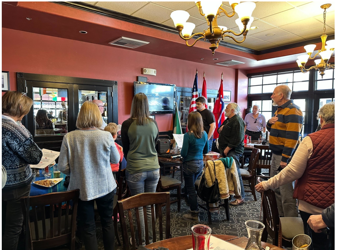
Members singing the National Anthems—the February meeting at the Lansdown Arms was a big success.