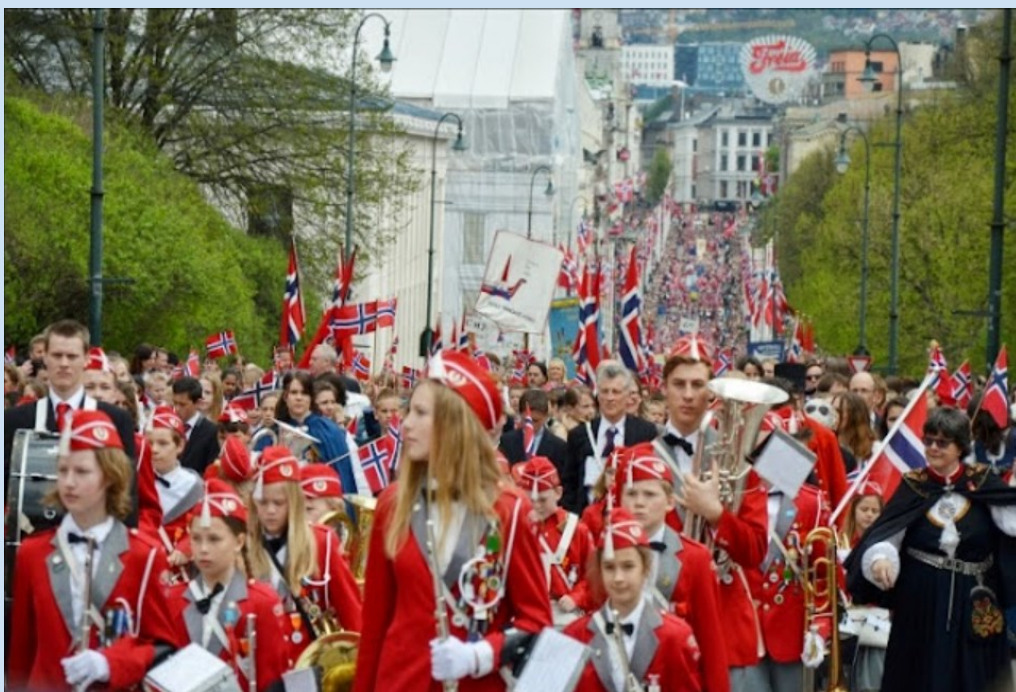
Fjelldalen March— April 2023 Newsletter

CBRE Completes Sale of the Sons of Norway HQ Building and Land for Uptown Redevelopment Project